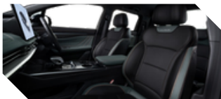
2-Tone Green (Only on Nordic Green Paint)