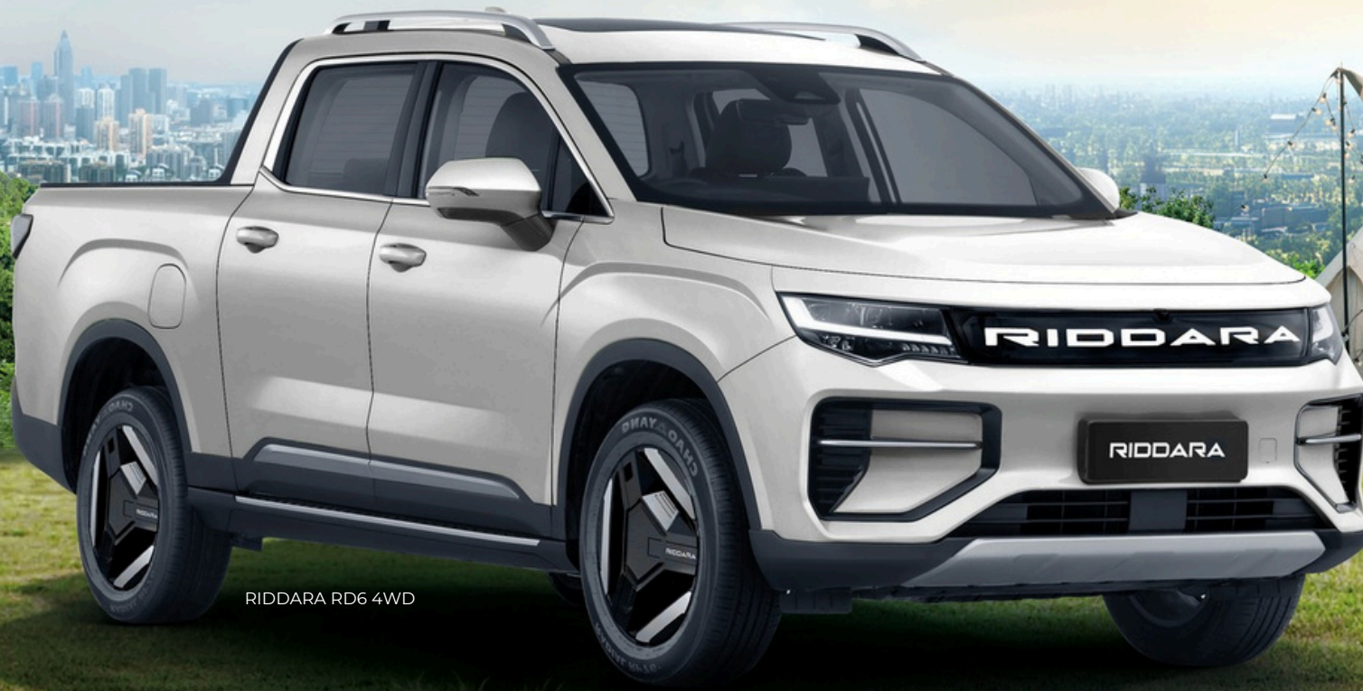
RIDDARA RD6 4WD

4WD Riddara RD6 Energy Consumption: EC: 18kwh/100km CVES: Band A